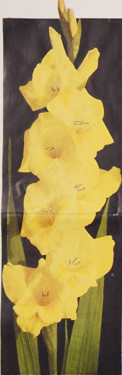
GOLDEN DREAM $1.15 for 10 $9.00 per 100